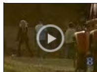
Lady Gaga Spotted At Shooting Range