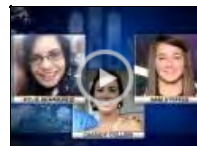
City Mourns After Crash Kills Teen, Injures Others